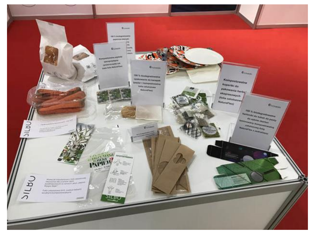
Fot. 2. The SILBO company offer during the Warsaw Pack Fair (as part of the Polish Chamber of Packaging showroom), during which the BIOCOMPACK-CE project was also presented.