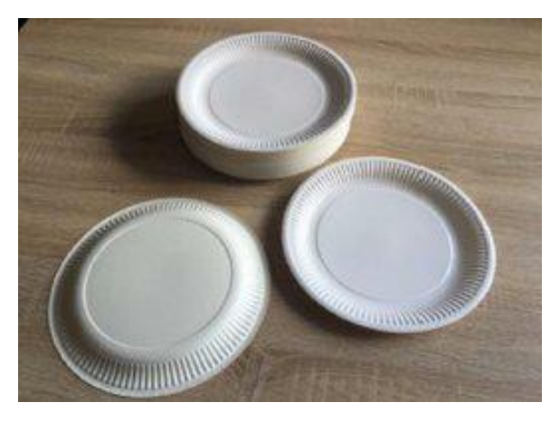
Fot. 1. 100% bodegradable paper plates laminated with NatureFlex cellulose foil

Compostable films laminated with paper are creating biocomposites. Although almost all of paper is not fully compostable in industrial conditions, it is considered biodegradable. All layers in such laminate come from raw materials from renewable sources (not from oil). On the Polish market there are products from this group made of paper (paper, cardboard or cardboard), laminated with NatureFlex cellulose film (paper plates, various types of cardboard boxes). In addition to aqueous glue and paints, they consist entirely of cellulose-derived materials.